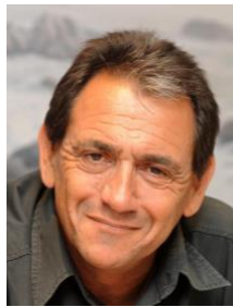
Eddy Cassar Safety & Rentals